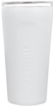
"Tumbler" White $34.95