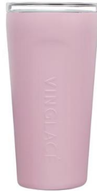
"Tumbler" Pink $34.95